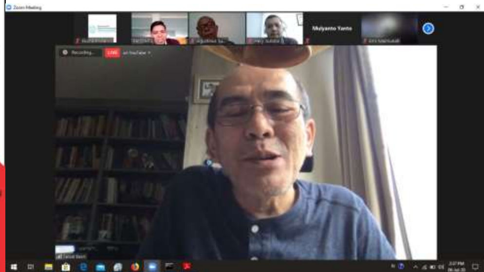
Forum Diskusi Kebangsaan 2